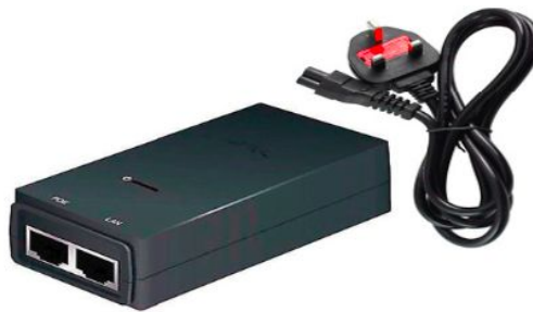
Power Over Ethernet (PoE) supply