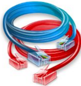
Cables (Colours may vary)